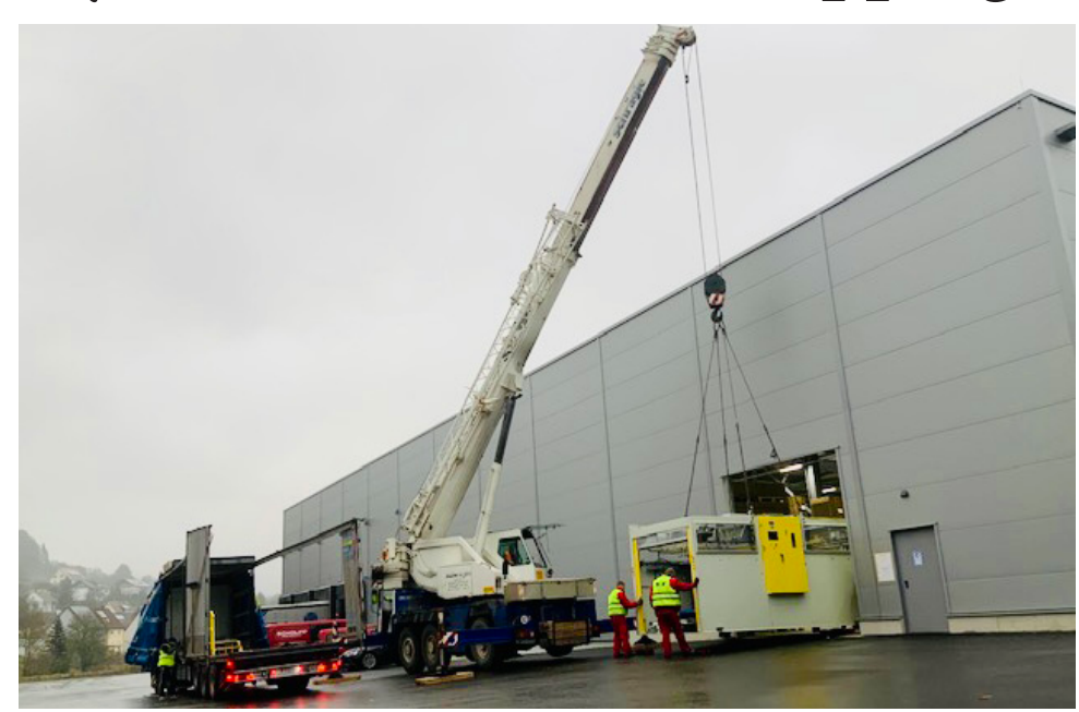
The Baysek C-170 die cutter entering Mayer Kartonagen headquarters in Haiterback, Germany, 14 December 2020.

With a total of 100 employees at two locations (headquarters in Haiterback in the Black Forest and a branch in Ottersweier near the Baden Region), Mayer Kartonagen processes a proud 15 million square meters of corrugated board (approximately 30 million individual packages) and generates sales of 14 million euros per year. A new hall completed in December 2019 is playing a key role in helping the company manage its growth and production capabilities.