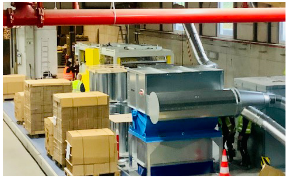
Clean & orderly finished Units ready for shipping preparation upon machine exit, load after load.